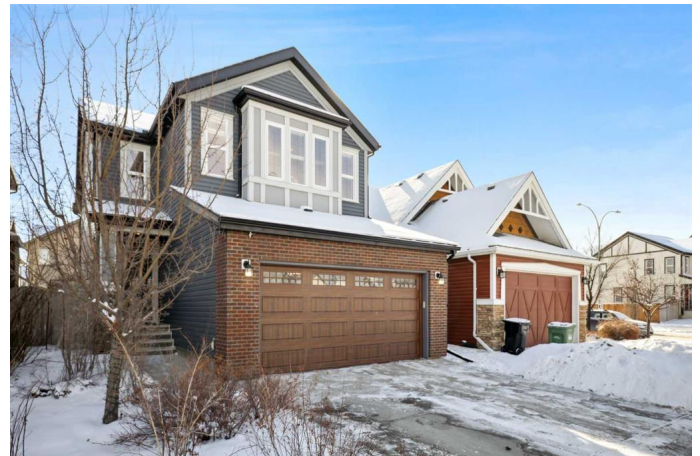
66 COPPERPOND HEATH SE

** Extensive upgrades and superior quality, with 3500 square feet of air-conditioned luxurious living space. You will be impressed with the privacy of an oversized traditional homesite with a private south-facing backyard with a bespoke 13' x 12' covered deck. This seasonal, airy design provides relief from the sunniest to the snowiest days while providing an uninterrupted view of the surrounding gardens. Enjoy this convenient Copperfield Location - Steps away from the ponds, Ice rink, parks, pathways, schools, shopping, soccer, skate park, health care, transit, South Pointe Hospital, and the major south expressways. Living a community lifestyle makes Copperfield an outstanding, safe, and secure community. Rich curb appeal with architectural features - dramatic roof lines, 24' x 21' attached garage with wood-style detailed door & full-sized concrete driveway, covered entry, and brick-faced front complete this spectacular elevation. There are extensive upgrades throughout, and the details are superb. This is a must-see home! Chefâ€™s kitchen includes granite countertops, custom light wood shaker style cabinets/doors, extension trims, high-end KitchenAid stainless steel fridge/dishwasher/microwave/wall oven, gas cooktop range with 5 burners, recessed lighting, oversized central island, peninsula island with a flush eating bar & black granite under mount sink, extra cabinet storage & a