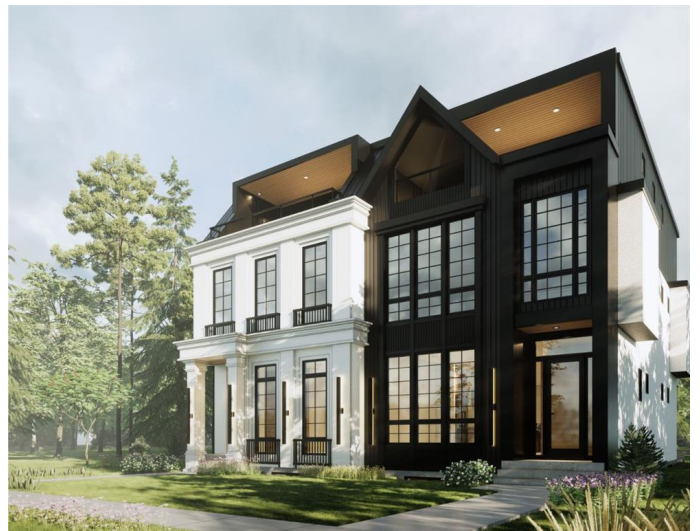
2311 23 Ave SW, Calgary, AB

Main Floor Exterior Area 815.79 sq ft Interior Area 750.67 sq ft